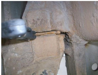
PP. 48. South west Billet No 2. ( East face. )

PP 48 - New hardox half joint packing system in place. Billets No 2. Gap & packer movement Evident. Slight noise when heavy vehicles pass over. (Picture showing current status. ) ( Will monitor. ) As inspection date 2015.04.13.