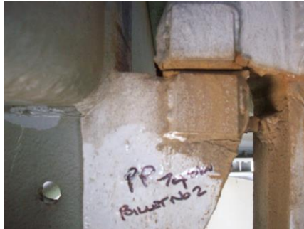
PP. 74. South west Billet No 2

PP 74 - New hardox half joint packing system in place. Billet No 2. Gap & packer movement Evident. Slight noise when heavy vehicles pass over. (Picture showing current status. ) ( Will monitor. )