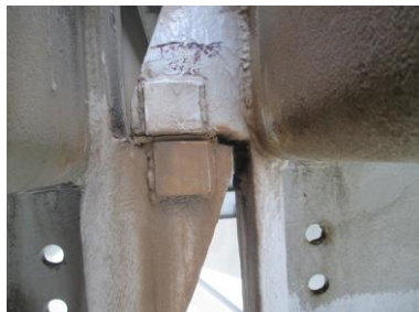
PP. 70 s/w.

PP 70 - New hardox half joint packing system in place. ( deck - panel movement evident this inspection. Sight gaps between packers & top jaw. will monitor ) Half joints remain satisfactory .