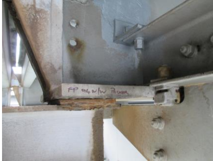
PP. 94. n/w. packing plates.

PP 94 - Packer plates fitted between billet top & stringer soffits. Remains in a satisfactory condition.