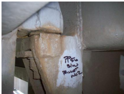
PP. 56. South west Billet No 2

PP 56 - New hardox half joint packing system in place. Billet No 2. Gap & packer movement Evident. Because of the slope on the jaws packers may drop out .Slight noise when heavy vehicles pass over. (Picture showing current status. ) ( Will monitor. ) As inspection date 2015.04.13.