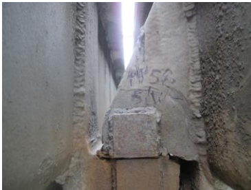
PP. 58. s/w.

PP 58 - New hardox half joint packing system in place. Deck panel movement this inspection. Gaps evident between fitted packers & top jaw of half joint. ( Will monitor.)