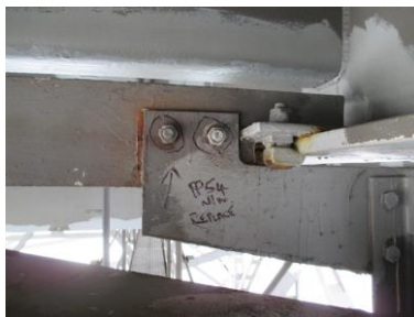
PP. 54 n/w. ( West side hanger plate bolts.)