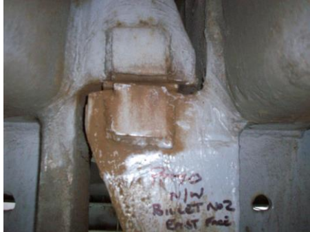
PP. 70. East face. Billet No 2

PP 70 - New hardox half joint packing system in place. Billet No 2. Gap & packer movement Evident. On east face of half joint. (Picture showing current status. ) Remains quiet A/T/O/I.( Will monitor. ) - As inspection date 2015.04.13.