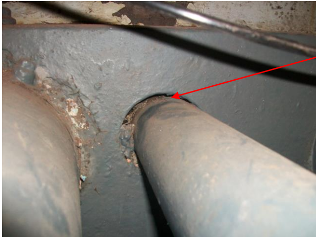
Crosshead block R 2. East sleeve top , void evident at Top and east side of sleeve .