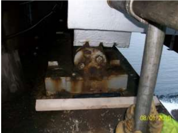
Photograph showing current status & condition of the North east viaduct box girder roller bearing & plinth from the east face.

Measurements taken from Datum point No. 2. as recorded –