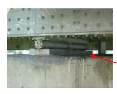
Roller bearing at S/E 4.