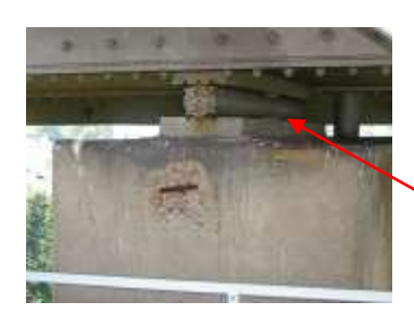
Roller bearing at S/E 6..