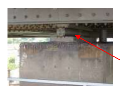
Roller bearing at S/E 7.