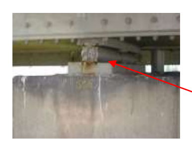
Roller bearing at S/E 5